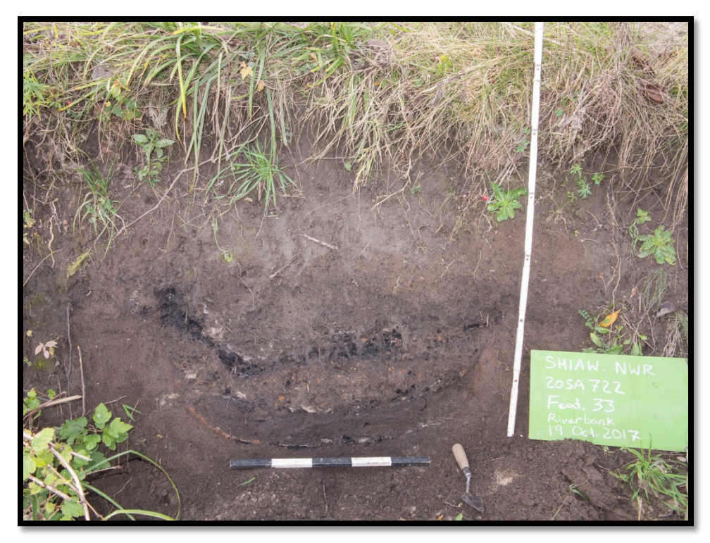
Figure 3: 20SA722, Feature 33.