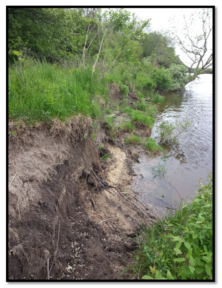
Figure 2: 20SA722, riverbank erosion.

more extensive erosion along portions of the site including one area where a multi-use hearth/trash pit feature (Feature 33) and a trash deposit (Feature 34) were exposed (Figures 2-4; Appendix C). A biface fragment found in the disturbed/slumped material from Feature 33 is discussed below with material recovered from flotation samples. Approximate grid coordinates for Feature 33, using the excavation grid previously established, are 592N 469E. Feature 34 is located at approximately 595N 466E.