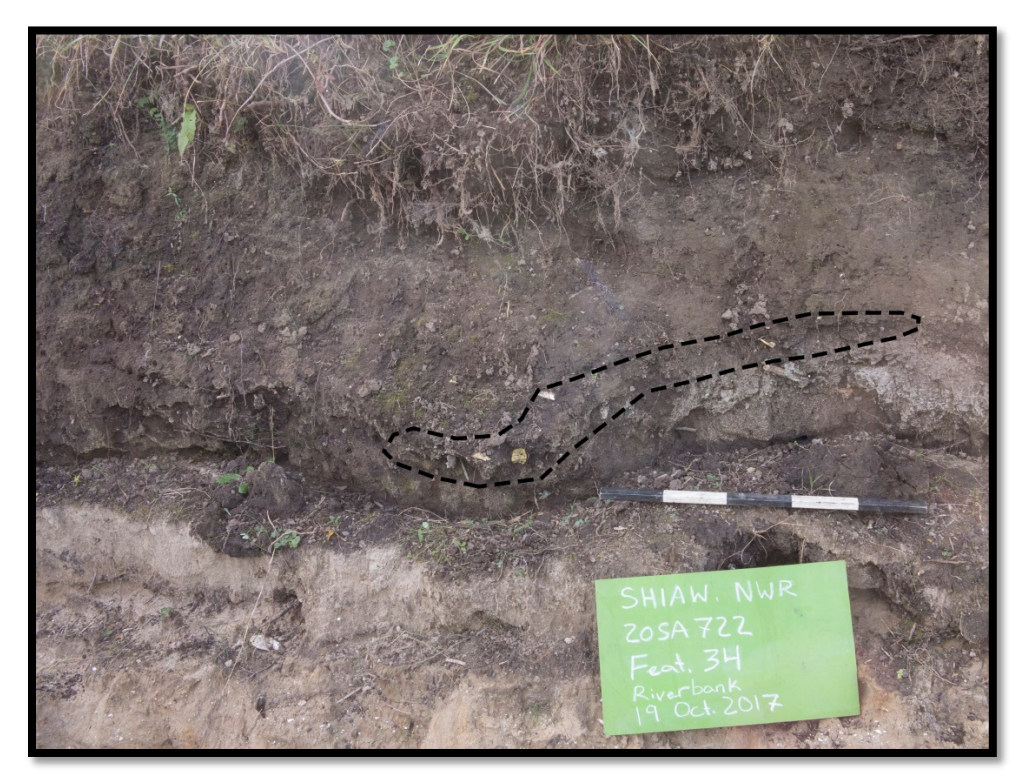
Figure 4: 20SA722, Feature 34. (dashed line is approximate extent of artifact concentration)