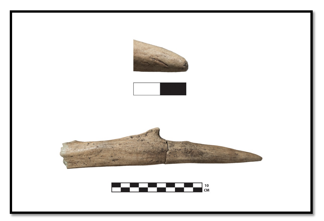
Figure 9: 20SA722, antler tine from Feature 34.

Faunal remains from Feature 34 include five mussel shell fragments, two of which are burnt, 205 fish scales, and 166 bone fragments. Several of the bone fragments are burnt, some to the extent of being calcined. No attempt has been made to identify the fish scales to more precise taxa. The bone assemblage includes 147 fish specimens, three medium-size mammal, six medium/large-size mammal, six large-size mammal, and four unidentified specimens. The fish assemblage includes lake sturgeon ( Acipenser fulvescens ), sucker (Catostomidae), catfish (Ictaluridae), and walleye ( Sander vitreus ). Identified mammals include muskrat ( Ondatra zibethicus ) and white-tailed deer ( Odocoileus virginianus ). In addition, two conjoining fragments of an antler tine may be from a large deer or elk/wapiti ( Cervus canadensis ) (Figure 9). The antler tine exhibits damage on the tip that could be related to use as a pressure flaker or other tool (Figure 9, top row). However, the damage is slight and could have occurred during the life of the animal. There are no other indications of intentional modification of the specimen.