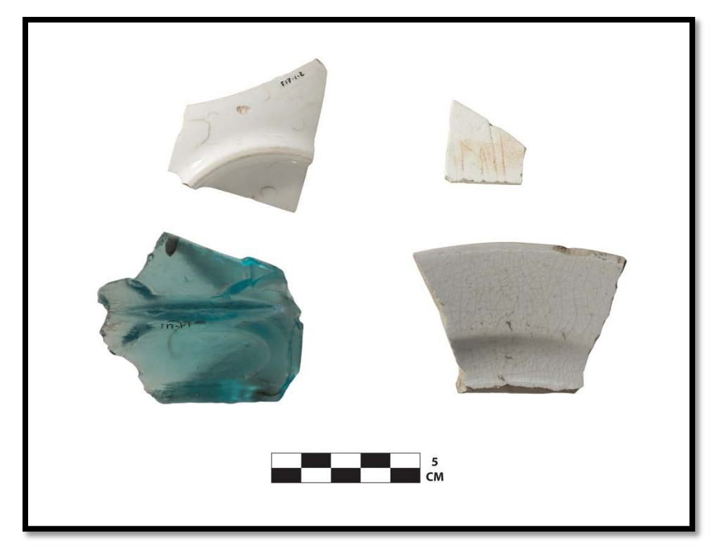
Figure 6: 20SA722, Historic Period Artifacts.