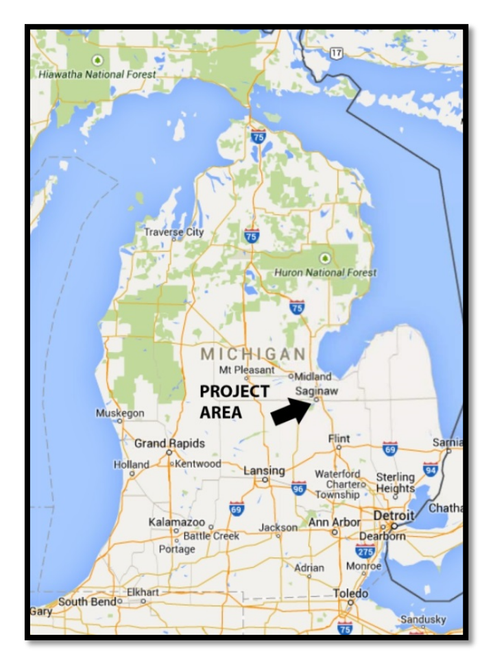
Figure 1: Project Area.

The project area is located in a region informally known as the Shiawassee Flats. This region generally conforms to the area covered by the mid-Holocene Nipissing level of the Great Lakes. Because most of the area lies only a few meters above the present level of the Great Lakes, even minor lake level fluctuations in the past would have had important repercussions for local inhabitants.