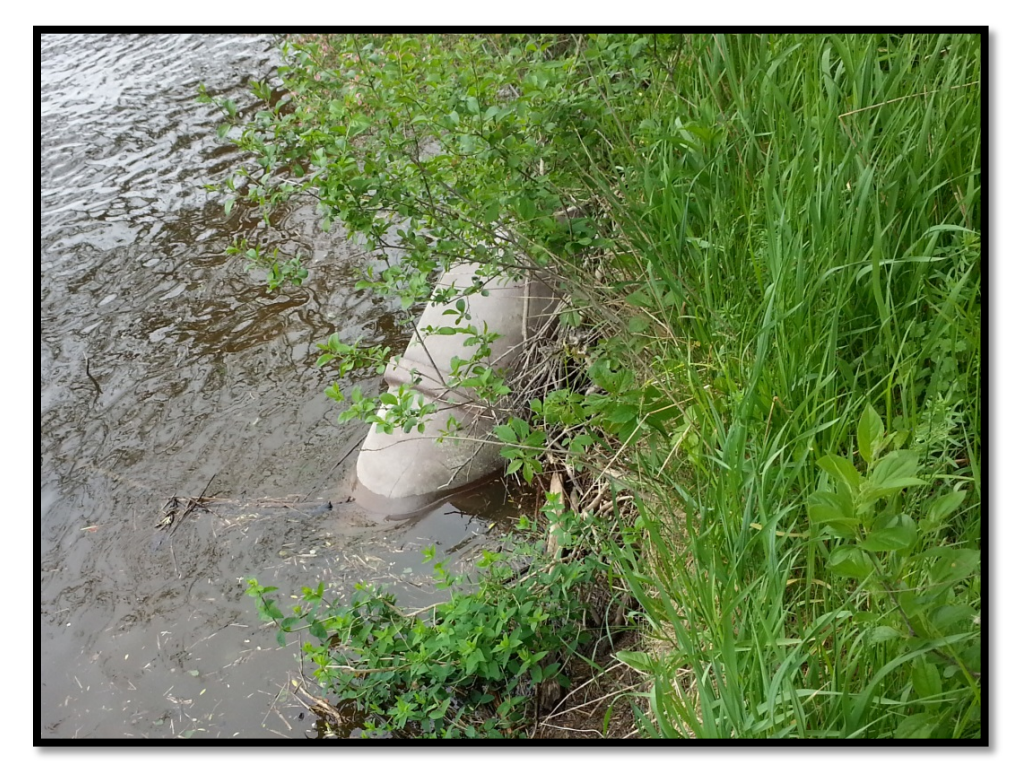
Figure 5: 20SA722, eroded well casing.

A second area of extensive erosion is located approximately 120-150 meters downstream. In 1999 and 2000, a ~65cm diameter, vitrified clay well casing was noted standing vertically and partially exposed in the riverbank. The location was initially determined by pacing to be Segment 5 west, 11 meters west and later corrected to Segment 4 west, 39 meters west using a 100 meter tape (field notes 24 Aug. 1999 and 13 April 2000; see also Sommer 2000:8 and 2001:8 for methods). In 2017, the well casing (at least the upper portion) was found eroded out and toppled (Figure 5). The field notes from 1999 and 2000 also indicate that a 15cm thick stratum of plaster, brick, charcoal, etc., was present in the eroding bank around 30cm below the surface and extending from the well casing approximately 15 meters downstream. A scatter of Historic Period artifacts, including several logging-related items, extended roughly 25 meters upstream and downstream from the well casing. The plaster stratum was still visible in 2017 and a sample of Historic Period ceramics and glass was collected approximately 5-10 meters downstream from the plaster stratum (Figure 6; Appendix C). Recent ongoing research suggests that this material may mark the location of a boarding house associated with the Tittabawassee Boom Company.